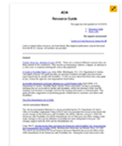
National Center for State Courts ADA Resource Guide