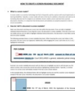
How to Create a Screen-Readable Document